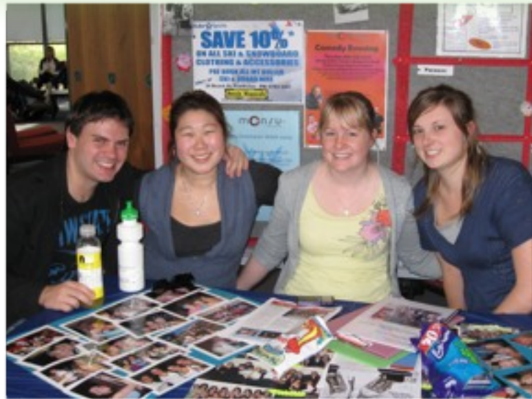
SOOT committee members on their stall