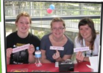
MUMS Monash Uni Midwifery Soc