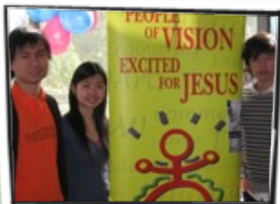
Campus Christian Movement