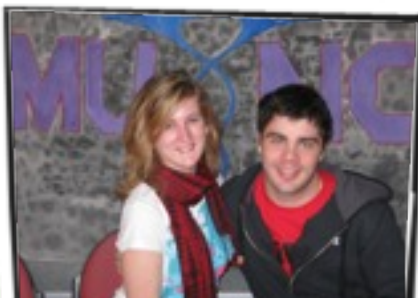
MUNCS - Monash Uni Nurses club