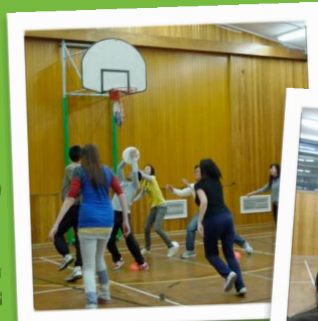
Working up a sweat on a freezing Melbourne night