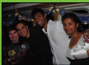
OSS Booze Cruise 2010