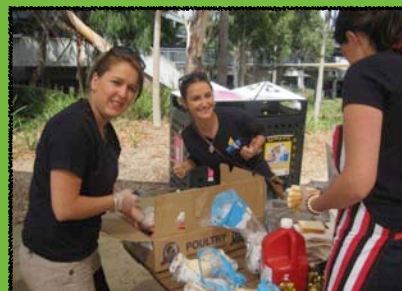
Monash Education Society's (MES) Welcome BBQ