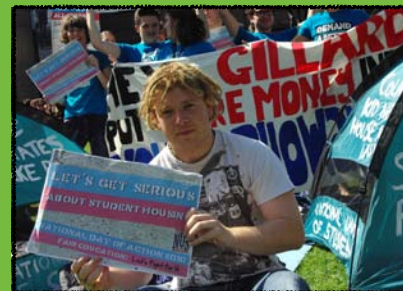
NUS Youth Allowance National Day of Action